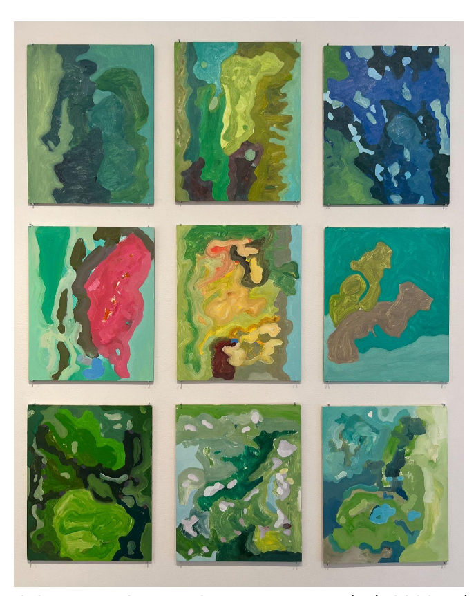
OONA RATCLIFFE, 9 Paintings, Untitled, 2022, oil on panel, courtesy of the artist.